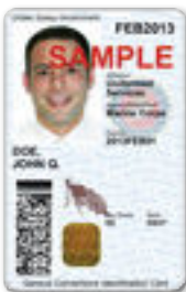
Common Access Card