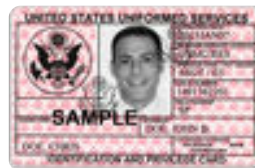
DD Form 1173-1

Retired Reserves Retired National Guard Eligible