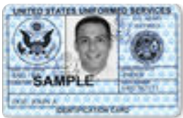
DD Form 2 (Retired)

100% Disabled Veterans Medal of Honor Recipients Some Retirees Eligible