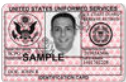
DD Form 2 (Reserve Retired)

Retired Reserves Retired National Guard Eligible