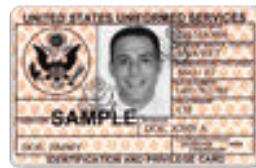
DD Form 2765

100% Disabled Veterans Medal of Honor Recipients Other Benefits-eligible Categories Eligible