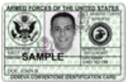
DD Form 2 (Reserve)

Eligible Service Members are active or retired members of the U.S. military, including the National Guard, Reservists, the U.S. Coast Guard, the U.S. Space Force, the Commissioned Corps of the U.S. Public Health Service (USPHS), and the Commissioned Corps of the National Oceanic and Atmospheric Administration (NOAA). Eligible Service Members (or their spouses) must present valid military identification pictured below.