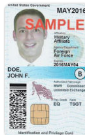
Common Access Card

Active Military Foreign Affiliate Eligible only with this ID (no other ID accepted)